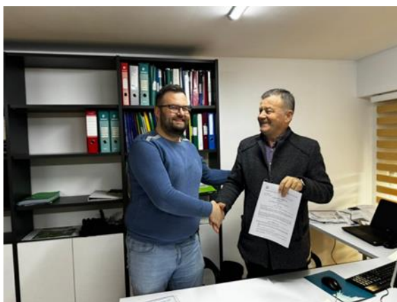
Figure 23. Signed agreement between UPT and Gent-ALBA ShPK