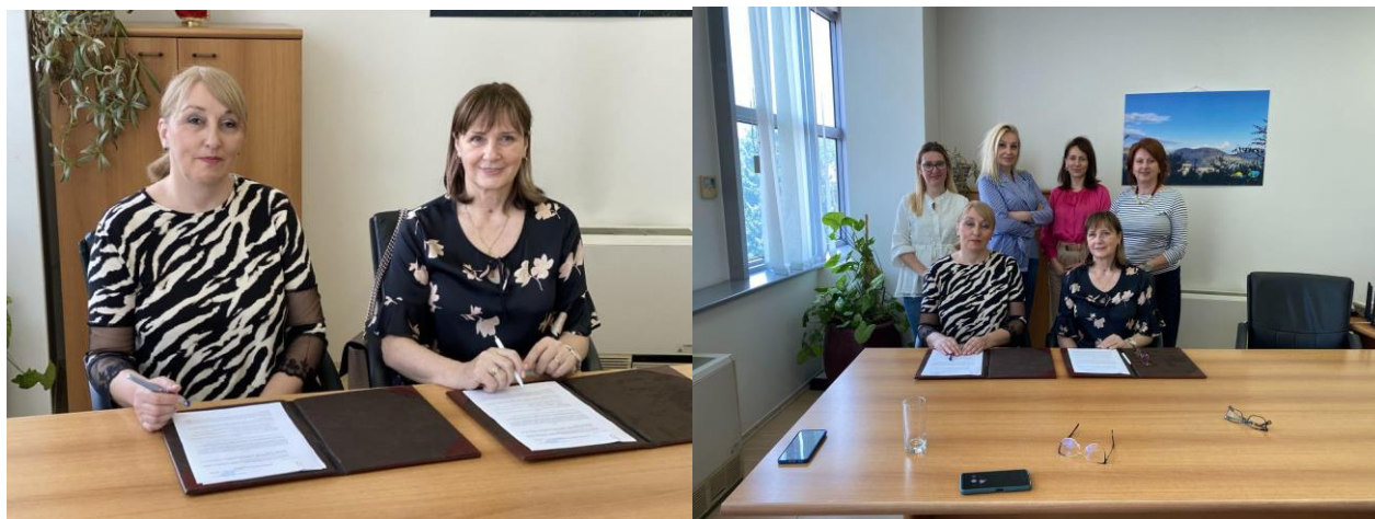
Figure 11. Signed agreement between UoM and Institute of Hydrometeorology and Seismology, Podgorica