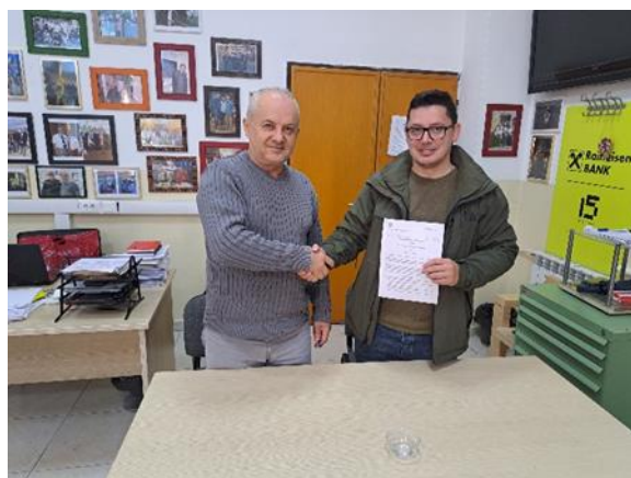
Figure 20. Signed agreement between UPT and MCE ShPK