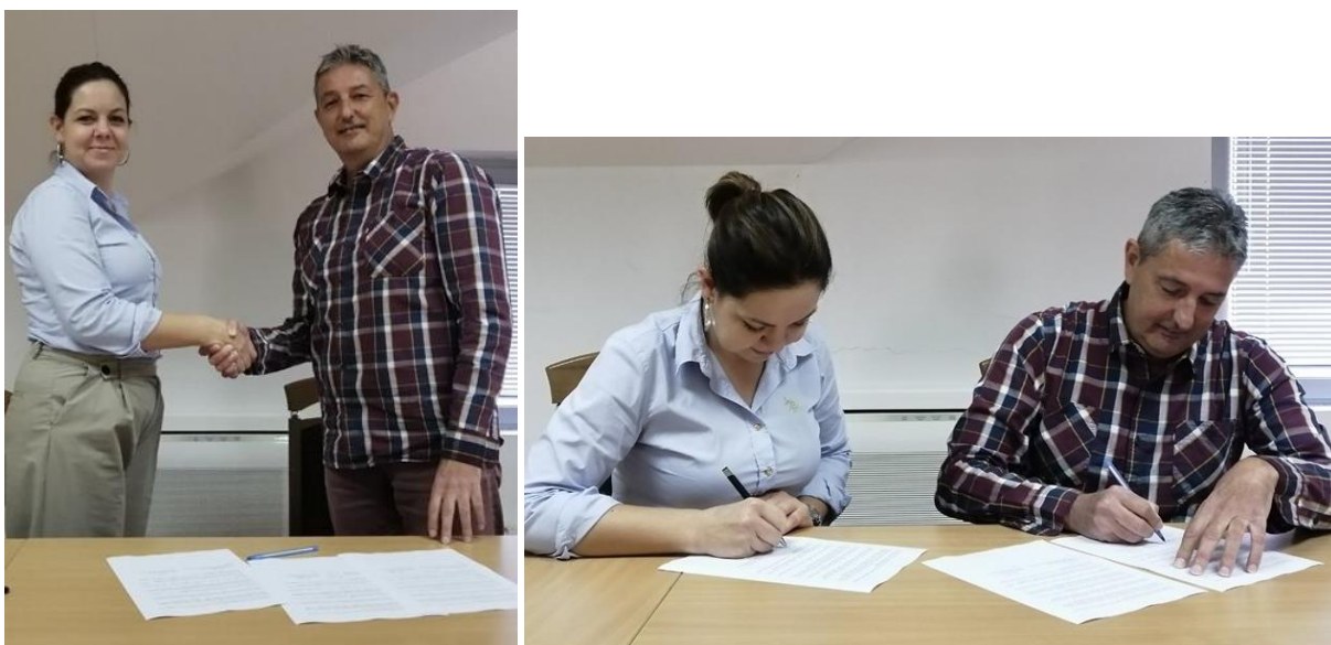
Figure 7. Signed agreement between UNMO and JP Vodovod doo Mostar

The University of Mostar (UNMO) has signed three Agreements for business-technical cooperation between the University and non-academic institutions.