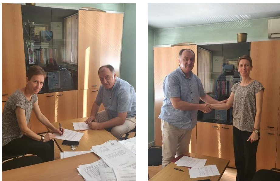
Figure 2. Signed agreement between UNBI and JKP „10 Juli“, Bosanska Krupa, B&H