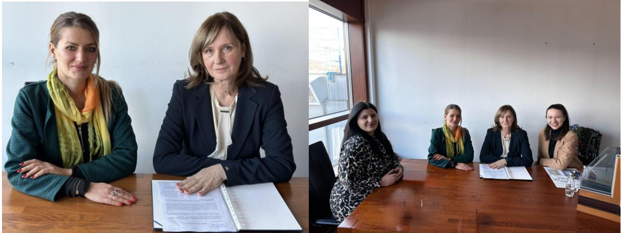
Figure 12. Signed agreement between UOM and VHM Solutions Ltd Niksic