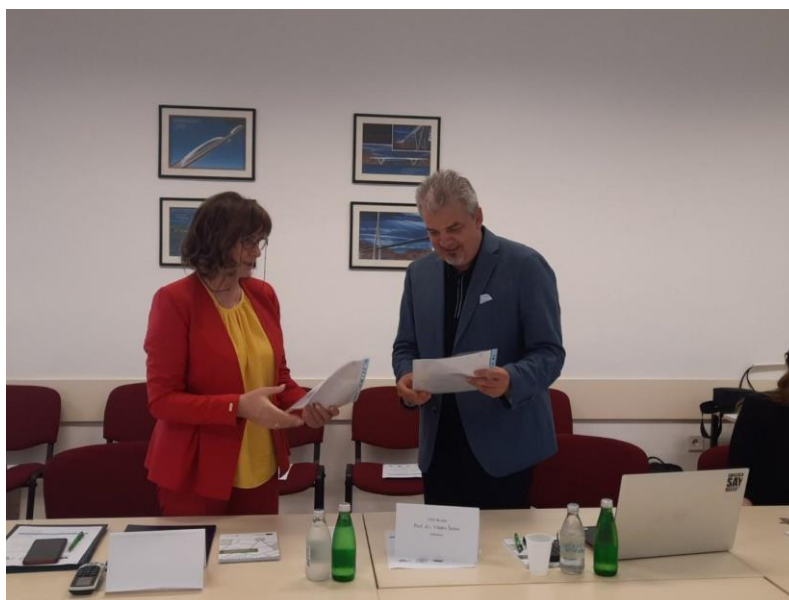
Figure 10. Signed agreement between UoM and the Institute of Earthquake Engineering and Engineering Seismology (IZIIS), Skopje

The University of Montenegro (UoM) has signed six Agreements for business-technical cooperation between the University and non-academic institutions.