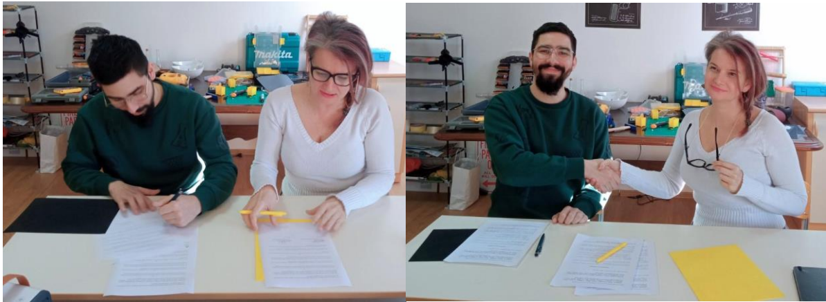
Figure 9. Signed agreement between UNMO and Garaža