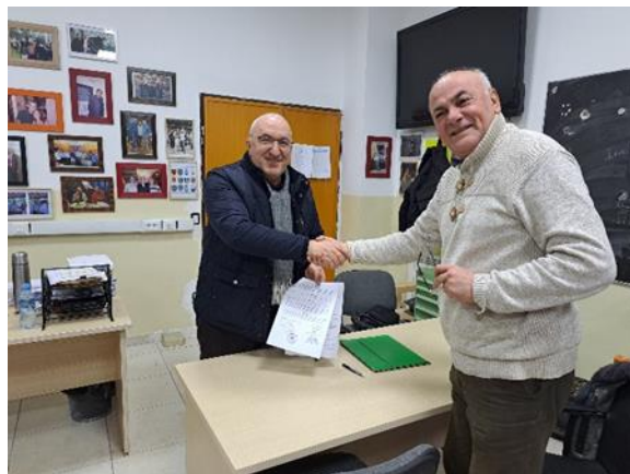
Figure 19. Signed agreement between UPT and FTA Studio ShPK