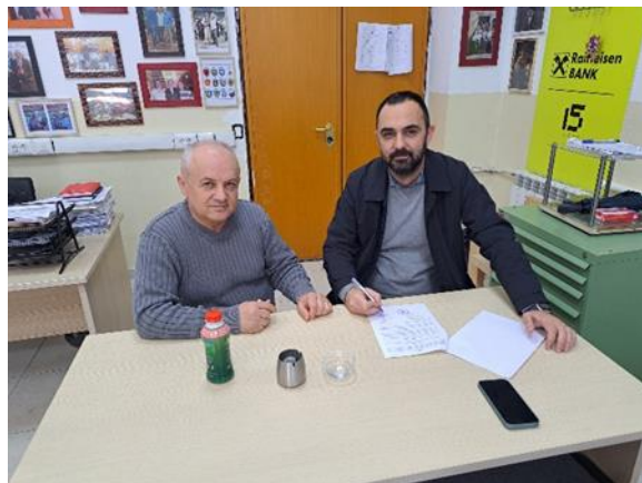
Figure 16. Signed agreement between UPT and AM-RES ShPK