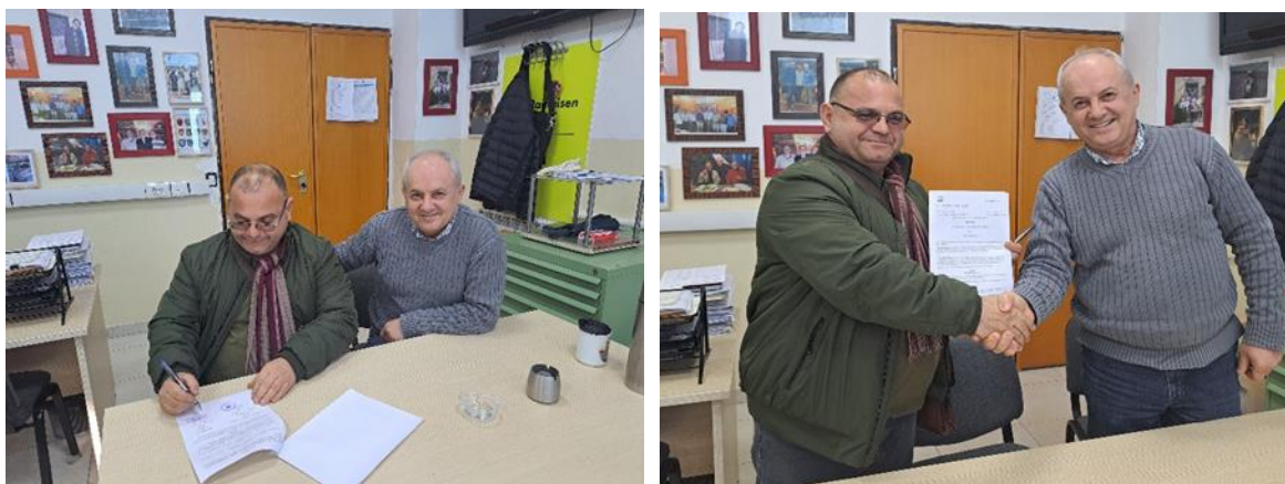
Figure 14. Signed agreement between UPT and NEW VISION PROJECT ShPK