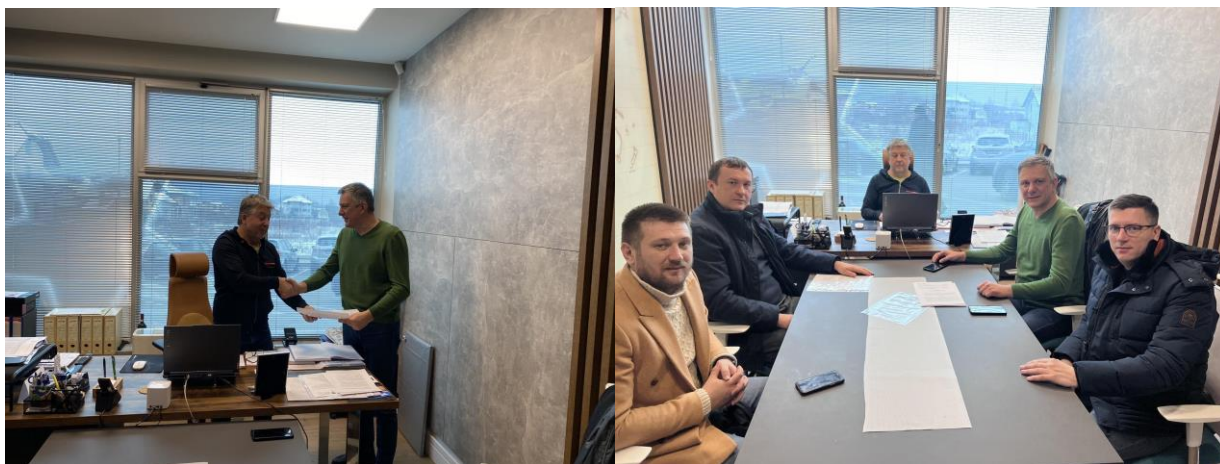
Figure 3. Signed agreement between UNBI and Euroing d.o.o, Bihać, B&H