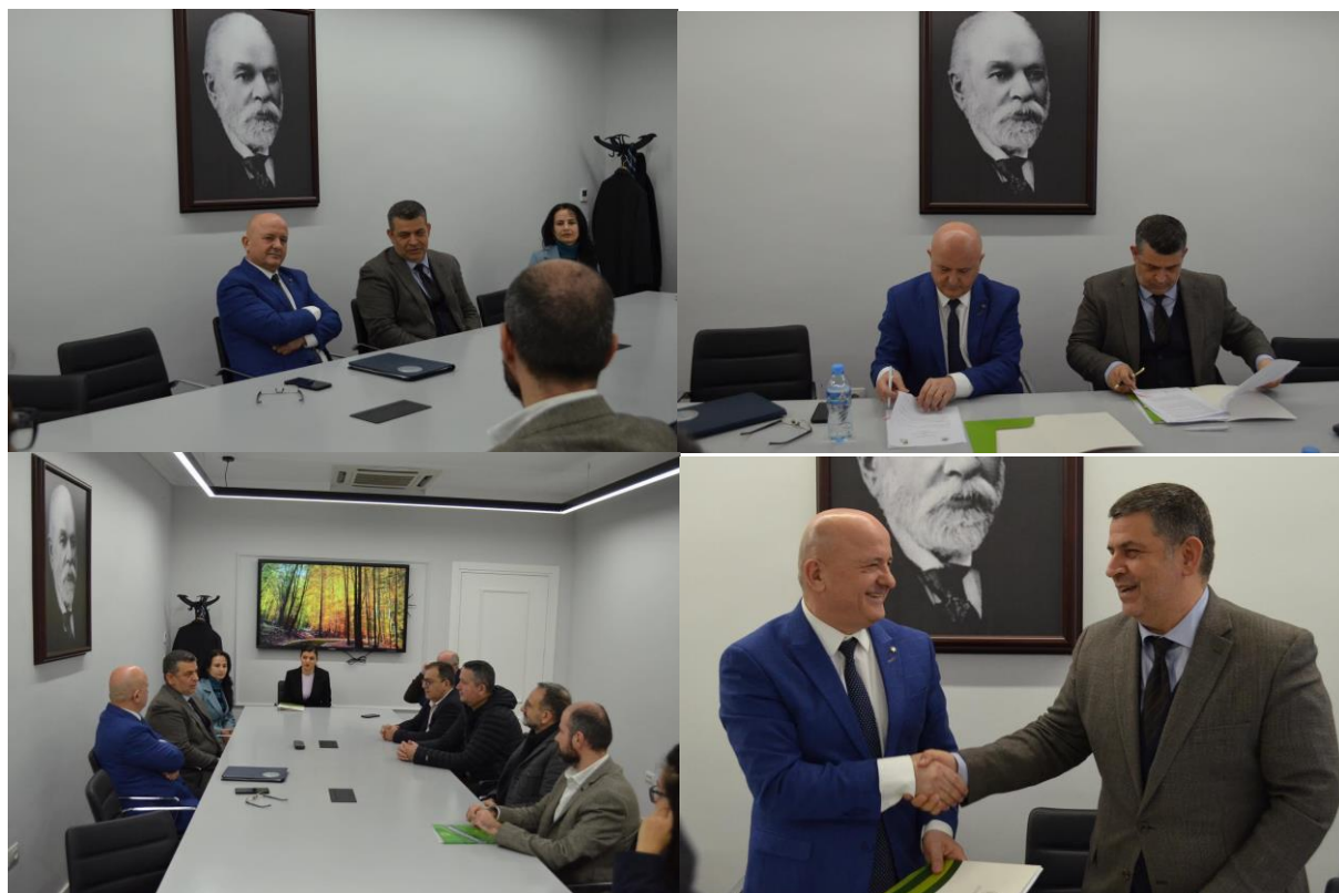
Figure 24. Signed agreement between U_POLIS and Agriculture University of Tirana

The Polis University (U_POLIS) has signed six Agreements for business-technical cooperation between the University and non-academic institutions.