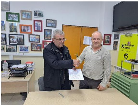
Figure 22. Signed agreement between UPT and Bajrami N. ShPK