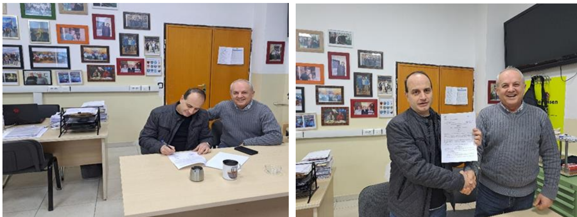
Figure 13. Signed agreement between UPT and K-M ShPK

The Polytechnic University of Tirana (UPT) has signed twenty Agreements for business-technical cooperation between the University and non-academic institutions.