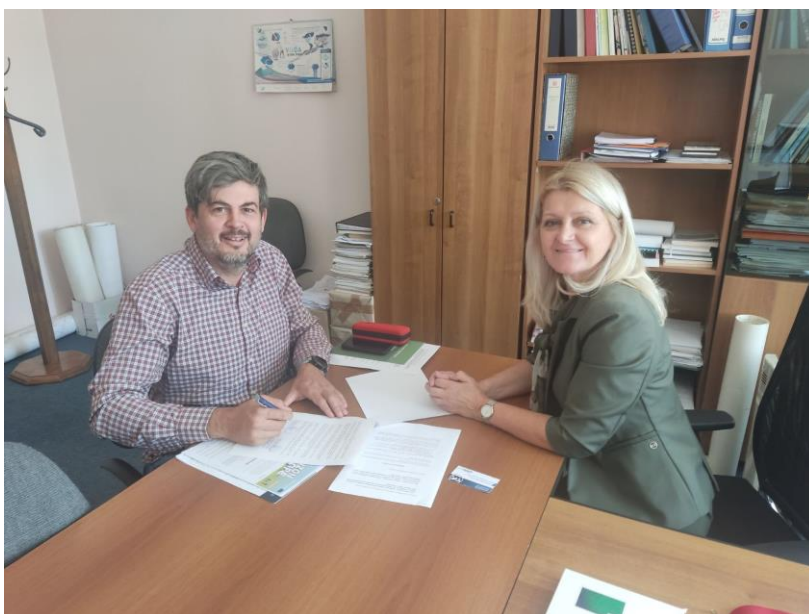
Figure 5. Signed agreement between UNSA and HKB d.o.o. Sarajevo, B&H

The University of Sarajevo (UNSA) has signed two Agreements for business-technical cooperation between the University and non-academic institutions.