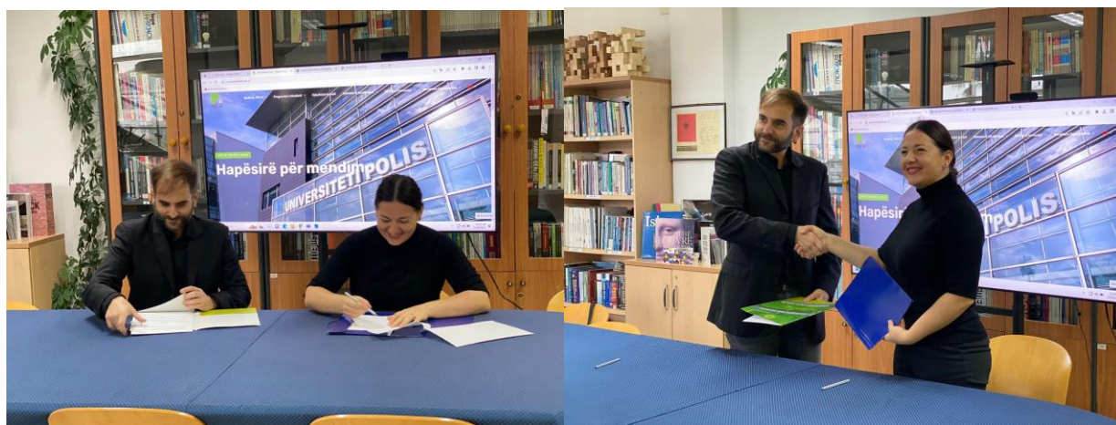
Figure 26. Signed agreement between U_POLIS and TERRA