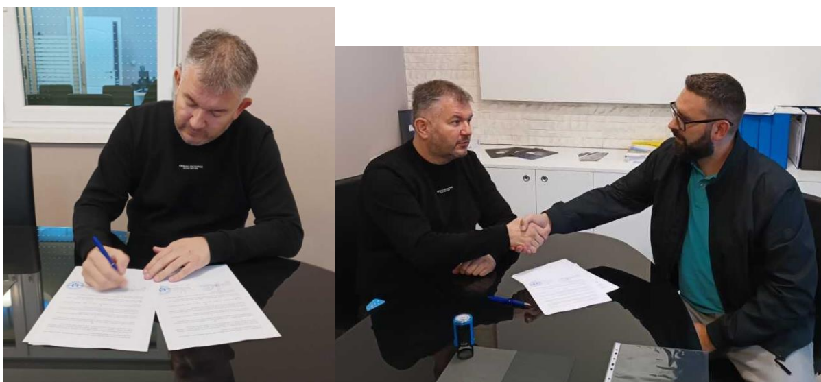
Figure 8. Signed agreement between UNMO and UNIS