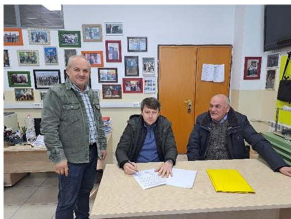
Figure 17. Signed agreement between UPT and Angerba ShPK