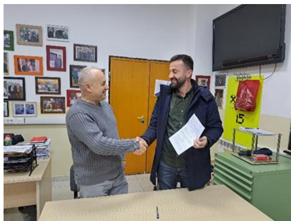
Figure 21. Signed agreement between UPT and GeoTech ShPK