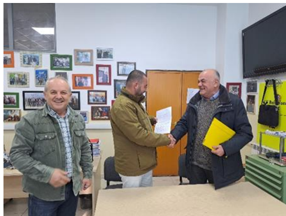
Figure 18. Signed agreement between UPT and Kadria 2023 ShPK