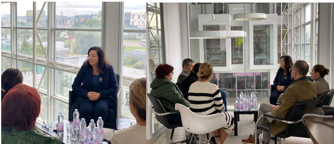
Figure 25. Signed agreement between U_POLIS and INSTAT (Institute of Statistics)