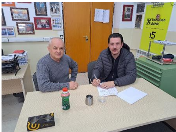
Figure 15. Signed agreement between UPT and GeoPoint-AL ShPK