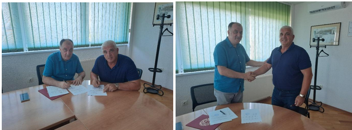
Figure 1. Signed agreement between UNBI and JKP „Komrad“ d.o.o. Bihać, B&H

The University of Bihać (UNBI) has signed four Agreements for business-technical cooperation between the University and non-academic institutions.