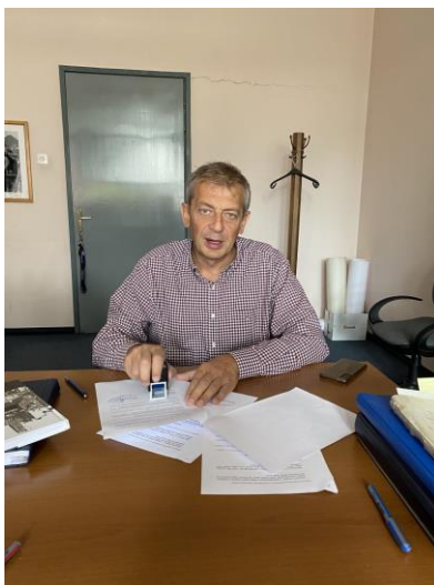
Figure 6. Signed agreement between UNSA and Hydro Control I.t.d. Sarajevo, BiH